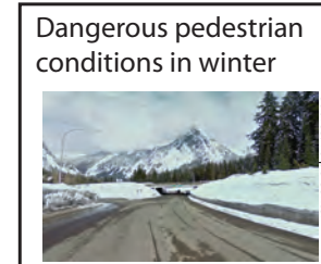
Snoqualmie Pass Visitor Center