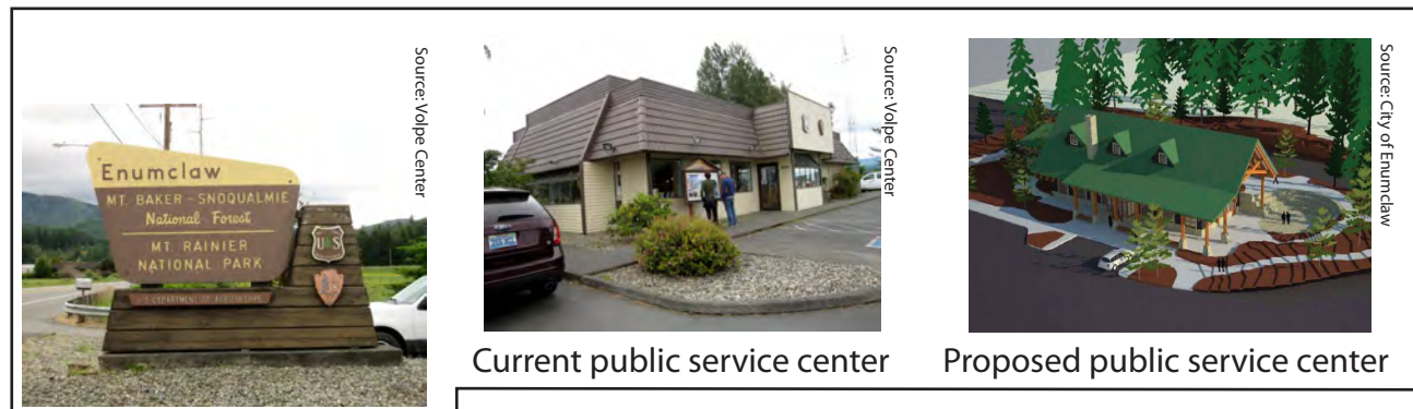
Current public service center

Average Daily Traffic Volume (ADT) 1,800 at milepost 47.41 (2010)