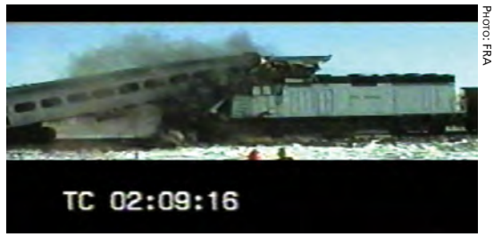
A frame from the conventional train-to-train impact test captures the moment of override.

For more than 100 years, conventionally designed car bodies have been built to support high loads without sustaining damage. This approach offers advantages, such as ease of design and demonstra-