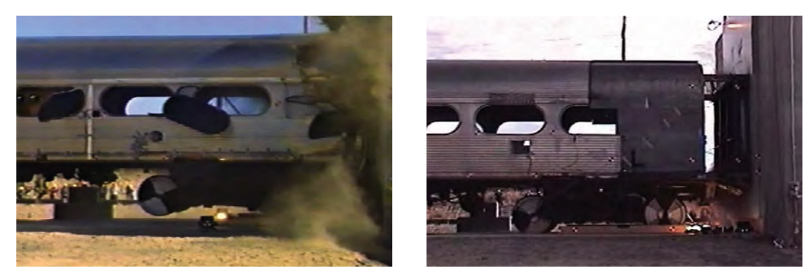
In tests of a single, conventional rail car crashing into a fixed barrier, the car body crippled haphazardly ( left ). The CEM equipment systematically absorbed the energy from the impact ( right ).

For the CEM tests, cars used in the conventional tests were modified to include crush zones on the ends (11). The center portions of the cars, between the body bolsters, were not modified, so that the strength of the primary structures remained unchanged.