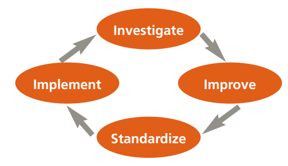
FIGURE 1 Approach to engineering research on rail equipment crashworthiness.

potential improvements are explored. Conventional and improved designs are tested, and the results are compared.